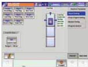
Parameter setting screen