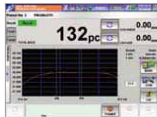
Inspection wave profile screen