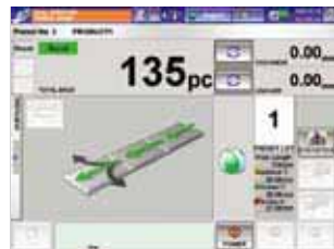
Basic operation screen