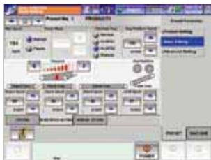
Basic setting screen