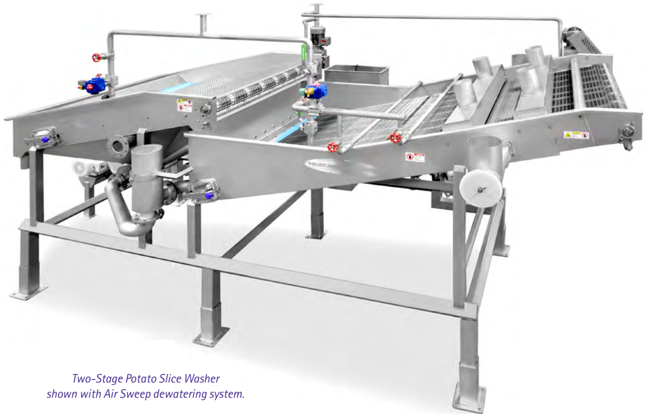
Two-Stage Potato Slice Washer shown with Air Sweep dewatering system.

Quickly rinse surface starch and particles from potato slices for uniformly finished chips and cleaner fryer operation.