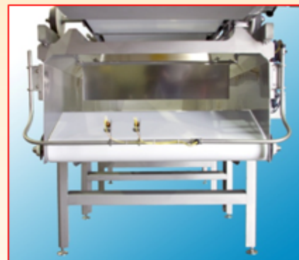
Internal let-down chute option & sloped discharge belt minimize product breakage.