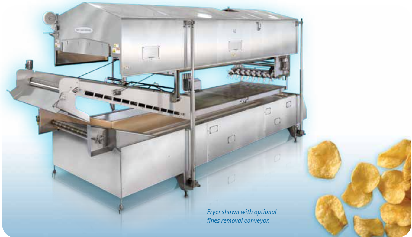
Fryer shown with optional fines removal conveyor.