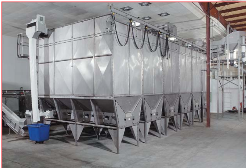
Bins are available in painted or stainless steel construction with a belt or auger discharge.