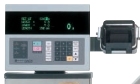
Remote Control Unit (RCU) and Printer.

The layout of the electronics on a single-layered panel within the vertical tower makes the machine design unique and offers remarkable accessibility for maintenance. This reduces downtime to a minimum.