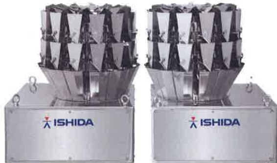
Optional off-set body design : To position two machines closely for 2-mix weighing applications.

No other multihead weigher supplier can match the innovation track record and global installed base of Ishida and this pioneering spirit has gone into this new innovation. The "Micro", the tiny but strong multihead weigher delivers the most flexible production solution within the smallest footprint whilst still delivering highest productivity and lowest product give away.