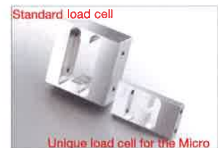
Standard load cell

"The Micro" delivers unbeatable weighing accuracy at impressive speeds. The Ishida designed and manufactured load cell measures as low as 0.01g load increments-allowing very low combination weights to be selected for target weights as low as 0.5g.