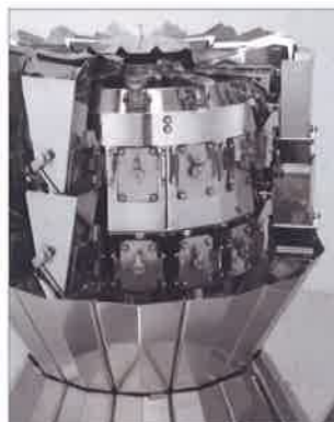
Minimal gaps at product transfer points