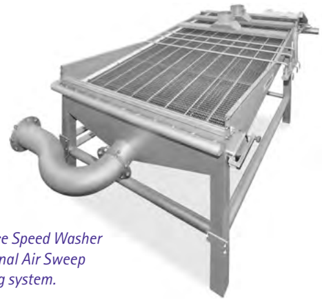
Potato Slice Speed Washer with optional Air Sweep dewatering system.