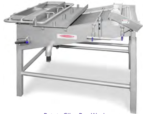
Potato Slice Pre-Washer with slicer mount and flume.

Constant improvement and engineering innovations mean these specifications can change without notice.