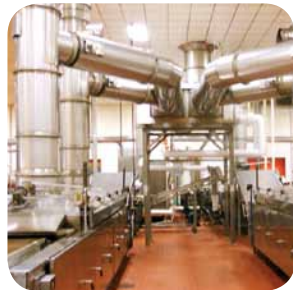
Energy Recovery Heat Exchanger installation

Ovens waste millions of BTUs in exhaust emissions that can be utilized with our Energy Recovery Heat Exchanger (ERHX). Pre-heat your fryer system's cooking oil, heat water for sanitation, or heat your building using energy you normally throw away. (see back page)