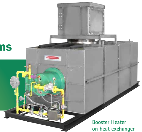
Booster Heater on heat exchanger

Looking for an edge to reduce manufacturing costs? Heat and Control offers proven systems that reduce fuel costs, air pollution and water usage.