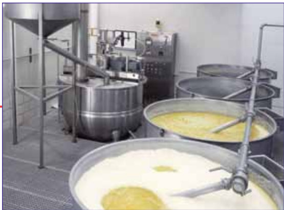
Manually controlled systems combine cost-efficient corn cooking with complete process control.

Manual, semi-automatic and fully-automated systems are specially designed for your production requirements.