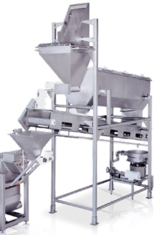
Soaked corn is pumped to the Corn Washer which removes hulls and lime before milling.