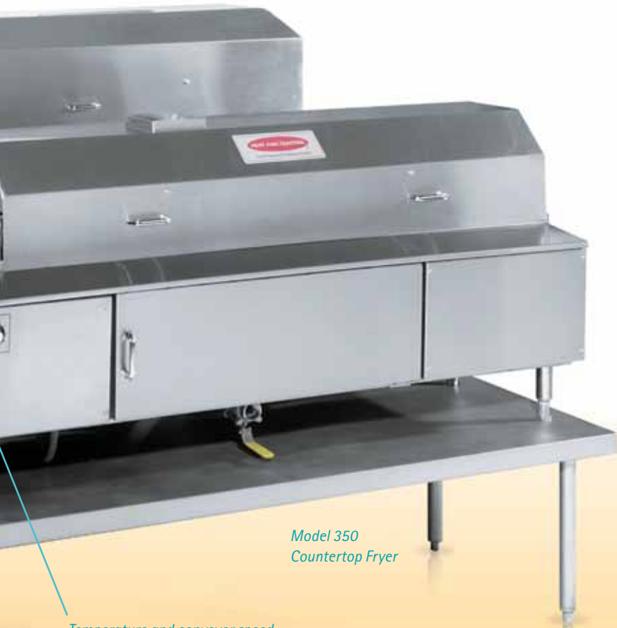
Model 350 Countertop Fryer

Temperature and conveyor speed are controlled from a convenient fryer-mounted panel.