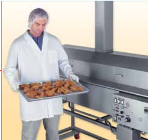
Countertop size compact fryers enable institutional kitchens to prepare a variety of foods with minimal changeover time.

Visit our Technical Centers to test your products on the versatile Mastermatic Compact Fryer.