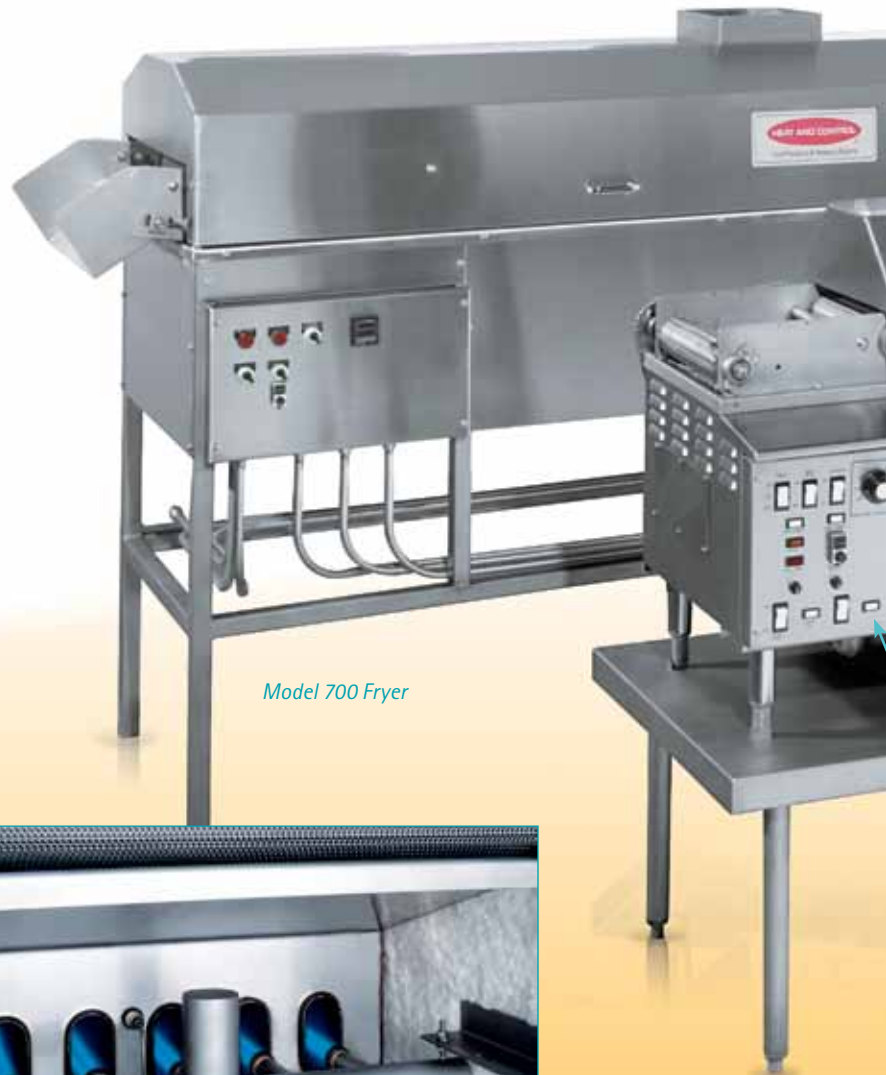
Model 700 Fryer

Easy-to-remove hoods, lift-out conveyors, and suspended heating elements simplify cleaning. Fryers are built to USDA standards.