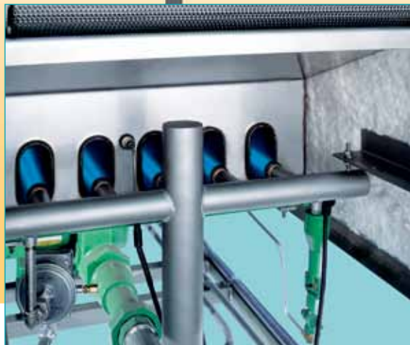
Model 700 fryers feature direct gas-fired heating. Model 350 and 450 fryers are electrically heated.