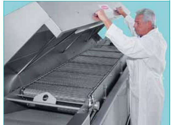
Each fryer features a tilt-open or lift-off hood.

Temperature and conveyor speed are controlled from a convenient fryer-mounted panel.