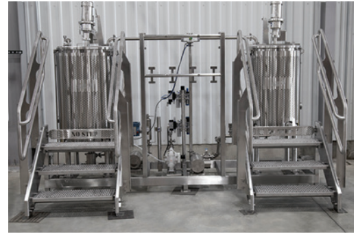
Mix/Use Tank Skid