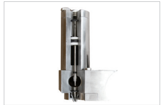
Slurry spray nozzle with piston cleanout mechanism