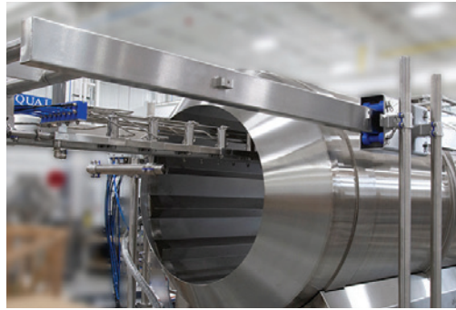
Optional manifold trolley pull out assembly

Engineered system solution for the most challenging product coating applications. Multi-nozzle manifold design expands coverage area and targets each product piece repeatedly to assure targeted application rate and consistently coated finish product.