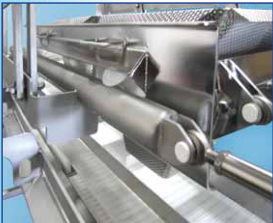
Shown with safety covers removed