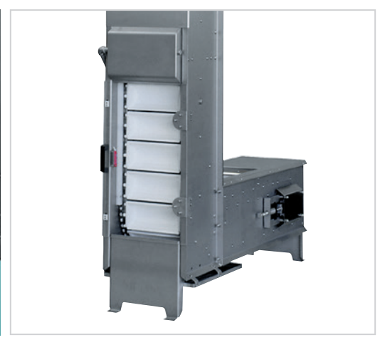
Tip-to-clean option aligns buckets in discharge position for easy floor-level cleaning.