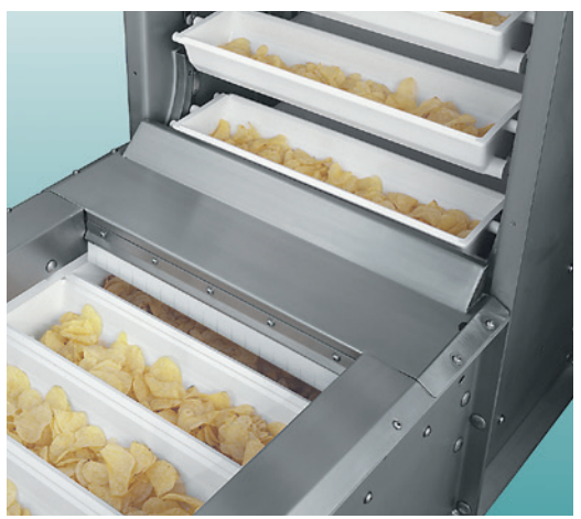
Overlapping buckets prevent product loss during loading.