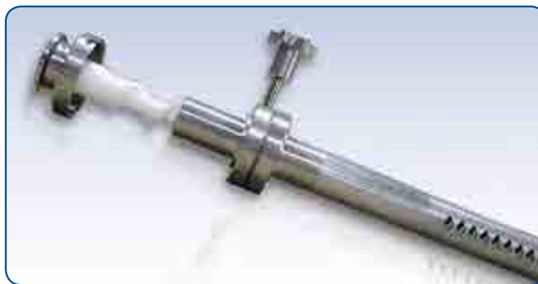
Precisely adjust seasoning delivery with our simple Uni-Spense worm gear control.

Constant improvement and engineering innovations mean these specifications may change without notice.