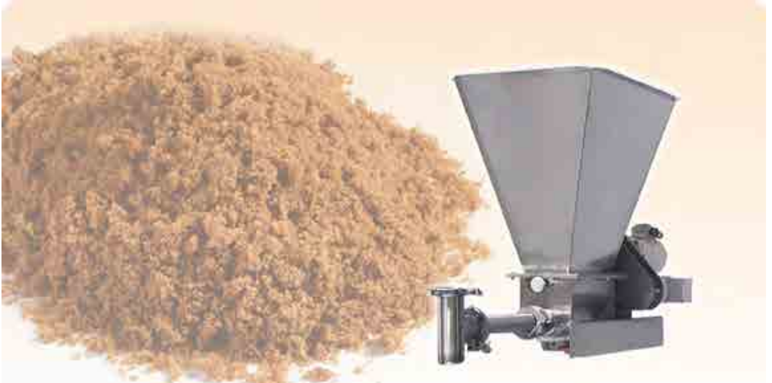
High Volume Uni-Spense III

Precisely distribute powders, granules and other products inside a coating drum, a blender, or over a conveyor belt.