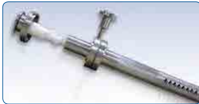
Precisely adjust seasoning delivery with our simple Uni-Spense worm gear control.