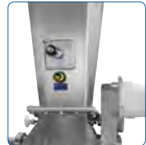
Pneumatic vibrator and low level sensor are standard.

Constant improvement and engineering innovations mean these specifications may change without notice.