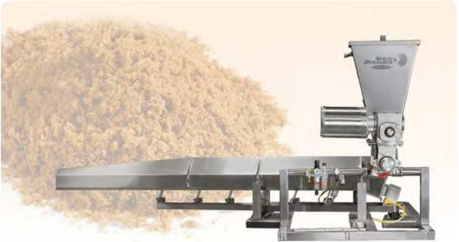
SureFlow-100 dispenses powder to a scarf feeder (shown) and other types of applicators.