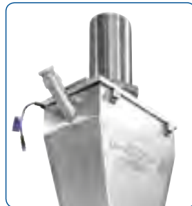
Optional connections for Powder On Demand (POD) transfer system.