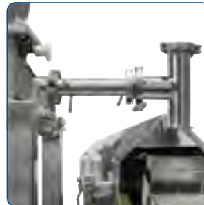
Optional transfer tube feeds a scarf plate seasoning distributor.