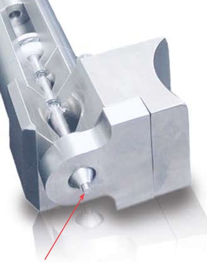
Clog-Free spray nozzles feature an automatic clean-out pin that can be adjusted for up to 25 pulses per minute to keep the nozzle clear of product pieces.