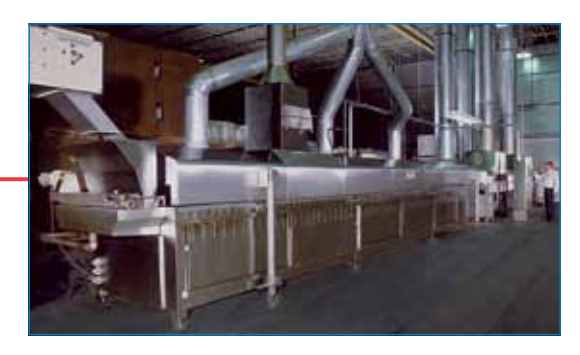
The world's leading nut processors rely on Mastermatic Nut Roasting Systems for reliable operation and consistently high product quality.

From compact to high capacity, Mastermatic Nut Roasting Systems are available in sizes to meet your unique production requirements.