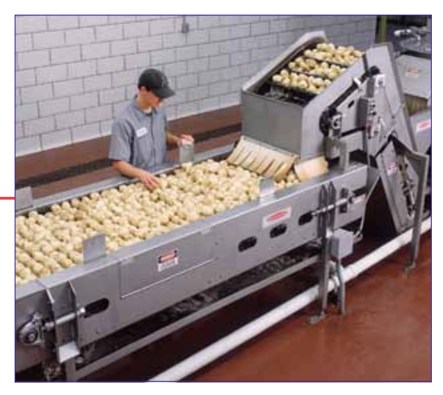
Inspection conveyors can be ordered with single or double lanes, movable cutting boards, and trim removal conveyors.

Choose the conveyor size and configuration that best fits your inspection process.