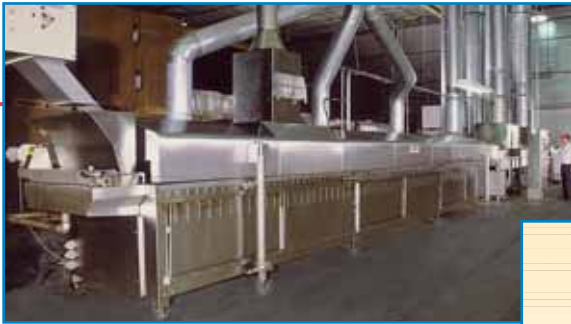
The world's leading nut processors rely on Mastermatic Nut Roasting Systems for reliable operation and consistently high product quality.

From compact to high capacity, Mastermatic Nut Roasting Systems are available in sizes to meet your unique production requirements.