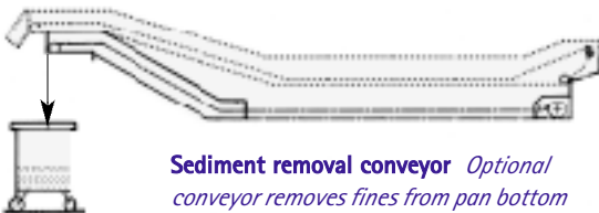
Sediment removal conveyor Optional conveyor removes fines from pan bottom and continuously deposits them into an external container. Note: Adds approximately 5 feet to fryer length.