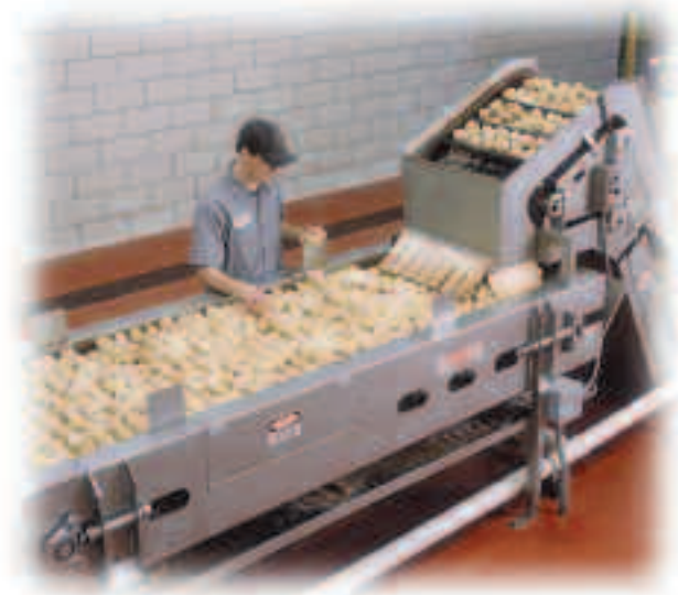
Inspection conveyors can be ordered with single or double lanes, movable cutting boards, and trim removal conveyors.

Choose the conveyor size and configuration that best fits your inspection process.