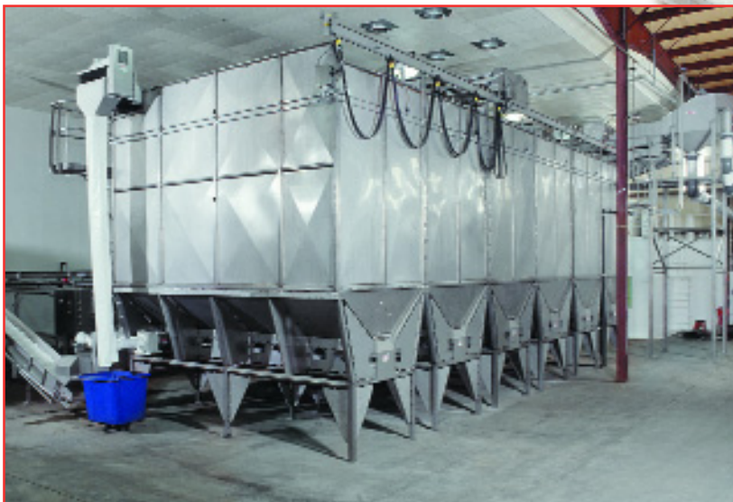
Bins are available in painted or stainless steel construction with a belt or auger discharge.