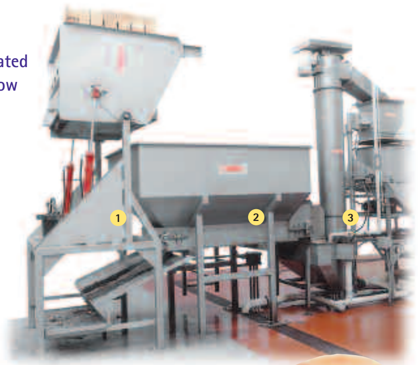
1 Crate Dumper 2 Metering Hopper (belt discharge) 3 Vertical Screw Elevator

Large diameter variable speed auger quickly elevates your product to peelers or other equipment, while separating rocks and other debris. The auger's rugged bottom bearing provides long service and easy maintenance. Flanged vertical tube simplifies auger removal and includes water sprays. Door in tank facilitates cleaning.