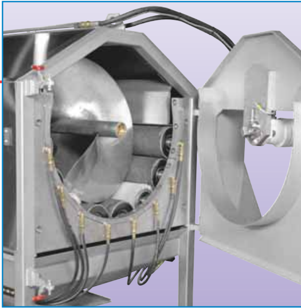
Hinged discharge end with recessed bearings allows quick roll changes.

Abrasive rolls, brushes or a combination of both are available in six, eight or ten roll configurations.