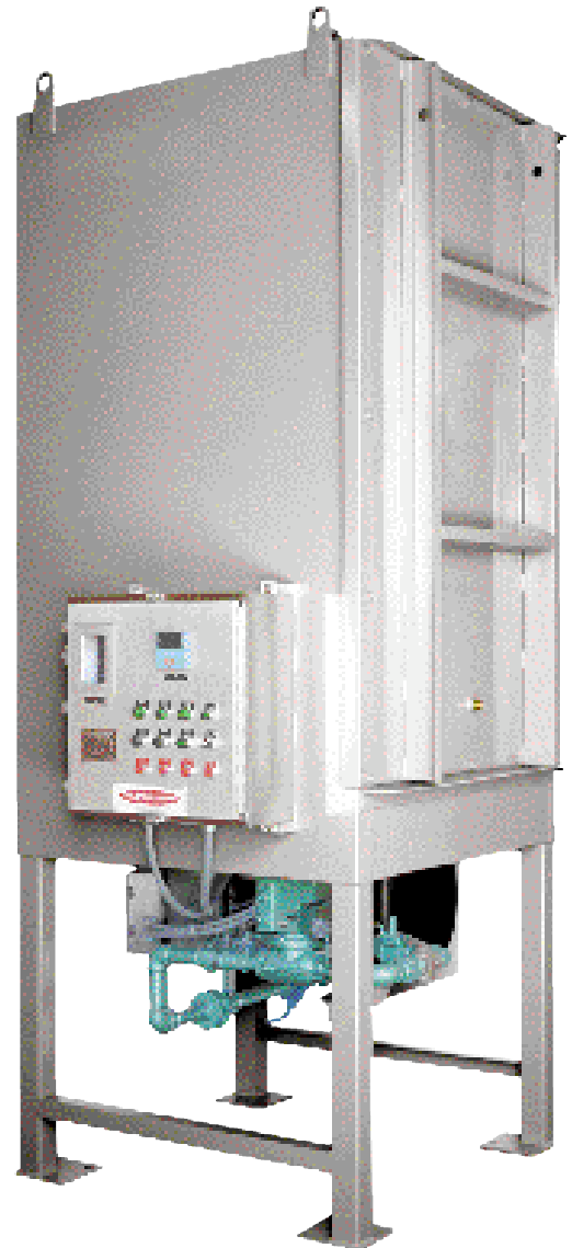
CTHX casing is available in painted steel or optional stainless steel as shown.

Pre-piped and pre-wired, the CTHX is ready for operation, and available in models to deliver from 150,000 to 3 million BTU/hour transfer to the cooking oil.