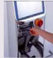
CF card slot