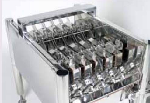
Main body without conveyor