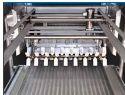
Chip-Stirr moves back and forth in the pan to uniformly fry potato slices.

Automatic oil level control maintains a consistent oil volume in the fryer.