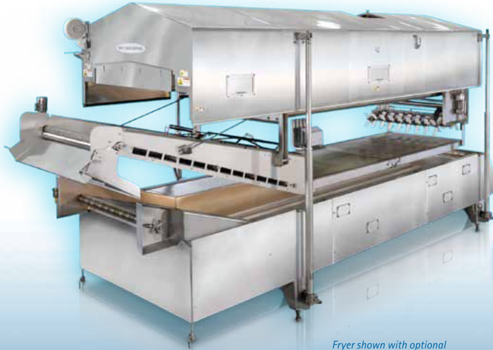
Fryer shown with optional fines removal conveyor.